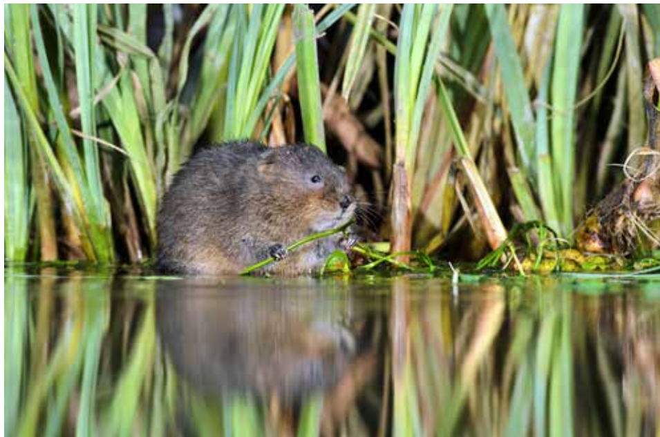
Water vole

Even in the heart of winter, rivers, streams, and ponds are teeming with life – including with one of our most endearing and much-loved mammals, the water vole.