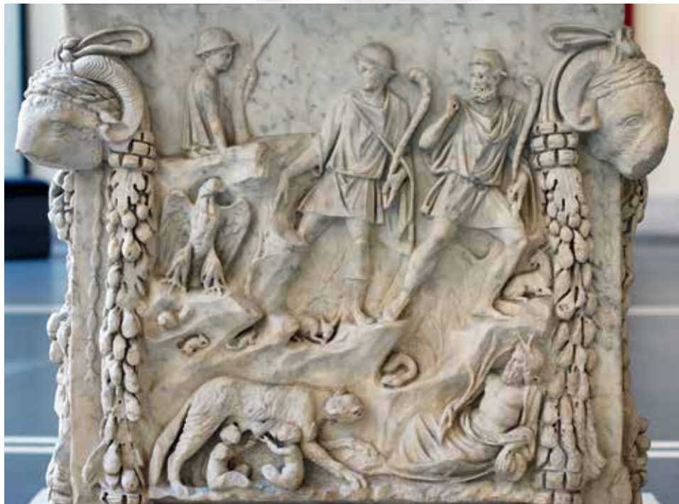
Photo: Iupercal from an altar to Mars and Venus in the Palazzo Massimo alle Terme in Rome by Mairé-Lan Nguyen

That ancient text still challenges us to show compassion to those with greater needs than our own. Sometimes a kind word is enough but let us allow ourselves to be stirred to further action according to our gifts and resources. On the global scale and in the smallest communities